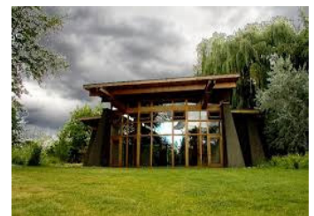
Chapel at Naramata Centre

For more information, or to register, call Naramata Centre at 1-877-996-5751.